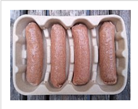
Beyond Sausage, raw