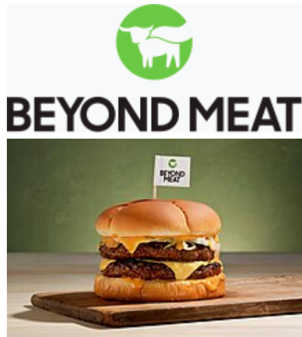
A Beyond Meat burger