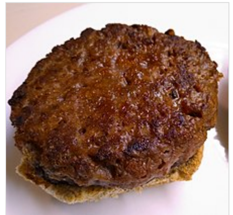
A Beyond Meat burger

The burgers are made from pea protein isolates, rice protein, mung bean protein, canola oil , coconut oil , potato starch , apple extract, sunflower lecithin , and pomegranate powder . [54] Beef products that "bleed" are achieved by using red beet juice . [55] The products are certified as not containing genetically modified ingredients. [56] The number of ingredients and processes involved in making the products mean they are classified as ultra-processed foods in the Nova classification . [57]