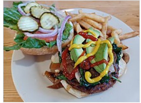
A Beyond burger served at a restaurant in Tuolumne County, California, United States