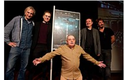
Cast and crew members at a press conference in October 2019.